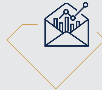
Continuous Integrated Development