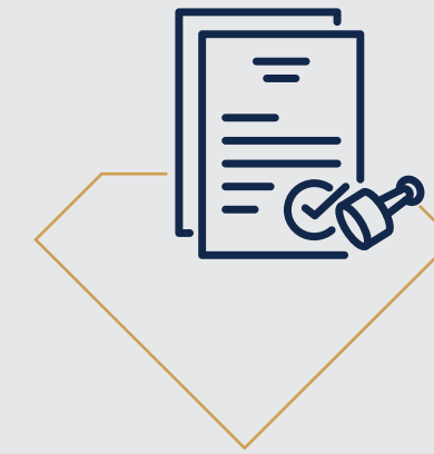
Integrity and Confidentiality