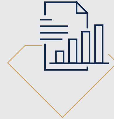
Governance of Procedures