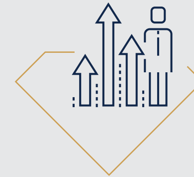
Creativity and Continuous Passion